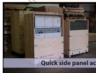
Quick side panel access