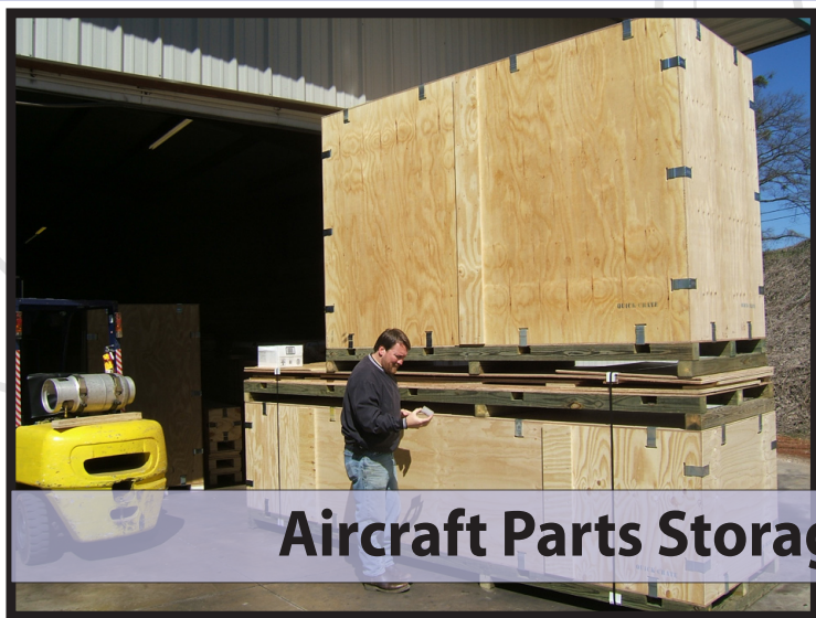
Aircraft Parts Storage

Quick-Crate offers you a shipping/storage solution whether you are transporting refurbished parts or unique items such as airframe components, jet engine nacelles and simulators. We have designed and built Quick-Crates over 14 feet long and others over 10 feet high for airplane parts storage. We can accommodate most any size that you can request and can be tailored to fit the needs of military, commercial and general aviation.