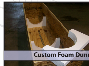
Custom Foam Dunnage