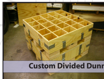
Custom Divided Dunnage