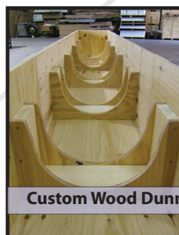
Custom Wood Dunnage