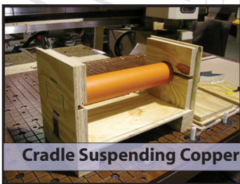
Cradle Suspending Copper Foil

Quick-Crate offers you a shipping/storage solution whether you are transporting refurbished parts or unique items such as airframe components, jet engine nacelles and simulators. We have designed and built Quick-Crates over 14 feet long and others over 10 feet high for airplane parts storage. We can accommodate most any size that you can request and can be tailored to fit the needs of military, commercial and general aviation.