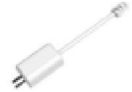
ePoE Over Coax Converter