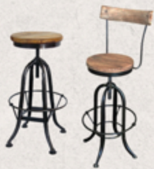
STOOL - ADJUSTABLE Seat: 33cm H: 62-80cm Also available with back.