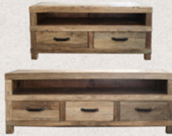
ENTERTAINMENT UNITS 2 Drawer 140x42x62cm 3 Drawer 180x45x64cm