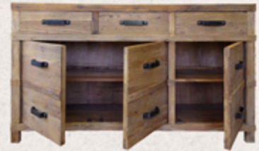
3 DRAWER / 3 DOOR BUFFET 160x45x90cm