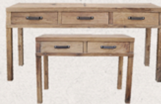
CONSOLE HALL TABLES 2 Drawer - 140x40x85cm 3 Drawer - 180x40x85cm