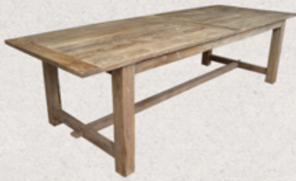
DINING TABLE - 3 Sizes Available: 184x90cm | 240x95cm | 290x100cm

Colours: Natural | Timber: Recycled Elm | Finish: Raw.