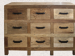
9 DRAWER CHEST 148x50x100cm