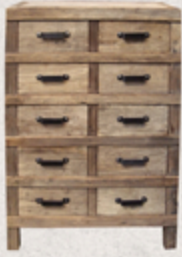
10 DRAWER CHEST 100x45x138cm

Colours: Natural | Timber: Recycled Elm | Finish: Raw.