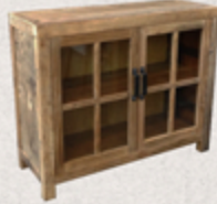
2 DOOR GLASS BUFFET 110x40x90cm