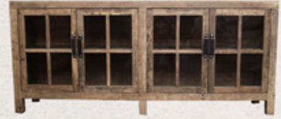
4 DOOR GLASS BUFFET 210x40x90cm