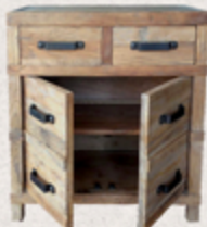
2 DRAWER / 2 DOOR BUFFET 80x45x85cm