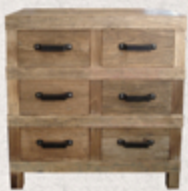
6 DRAWER TALL 90x45x90cm