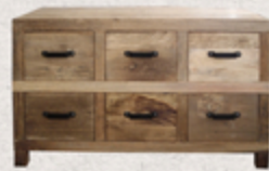
6 DRAWER WIDE 148x50x85cm