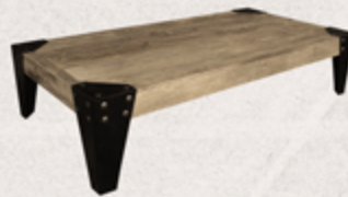
IRON COFFEE TABLE Small: 130x70x36cm Large: 160x80x36cm