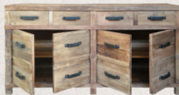
4 DRAWER / 4 DOOR BUFFET 180x45x90cm