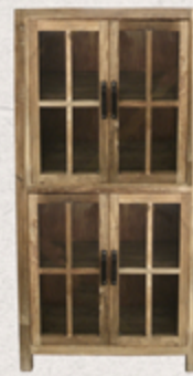
TALL GLASS DISPLAY 95x40x190cm