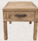
LAMP TABLE 55x55x55cm