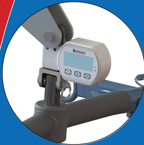
PL500 Shown with DSC700