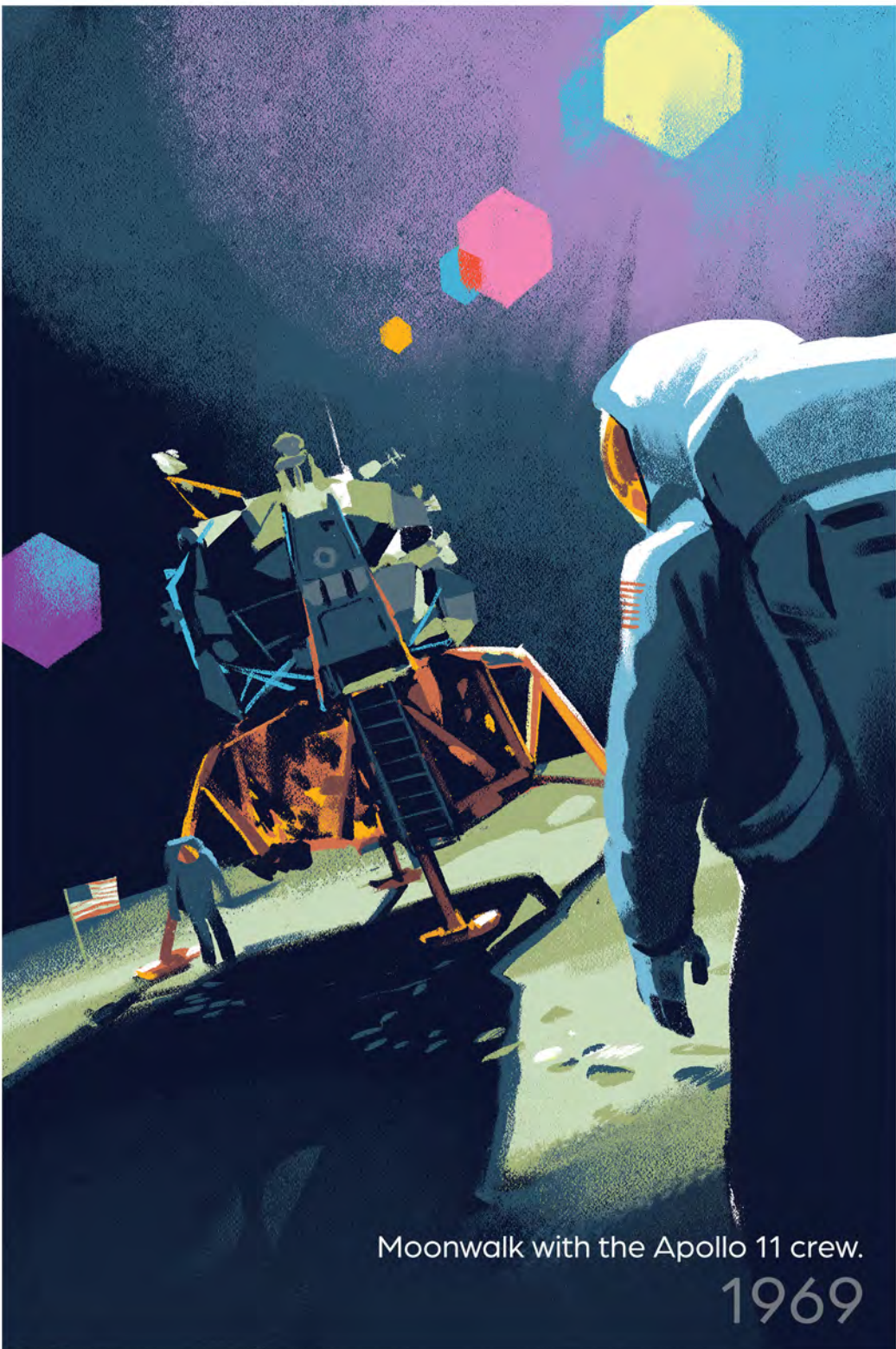
Moonwalk with the Apollo 11 crew. 1969