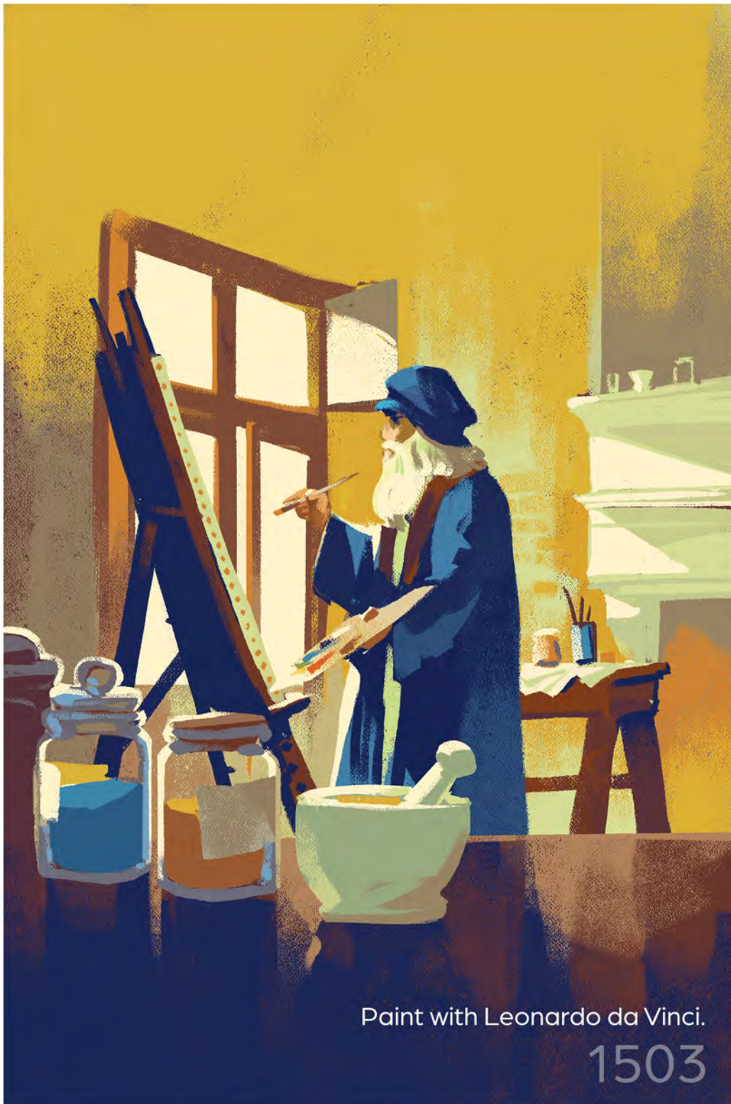
Paint with Leonardo da Vinci.