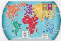
1 Map board