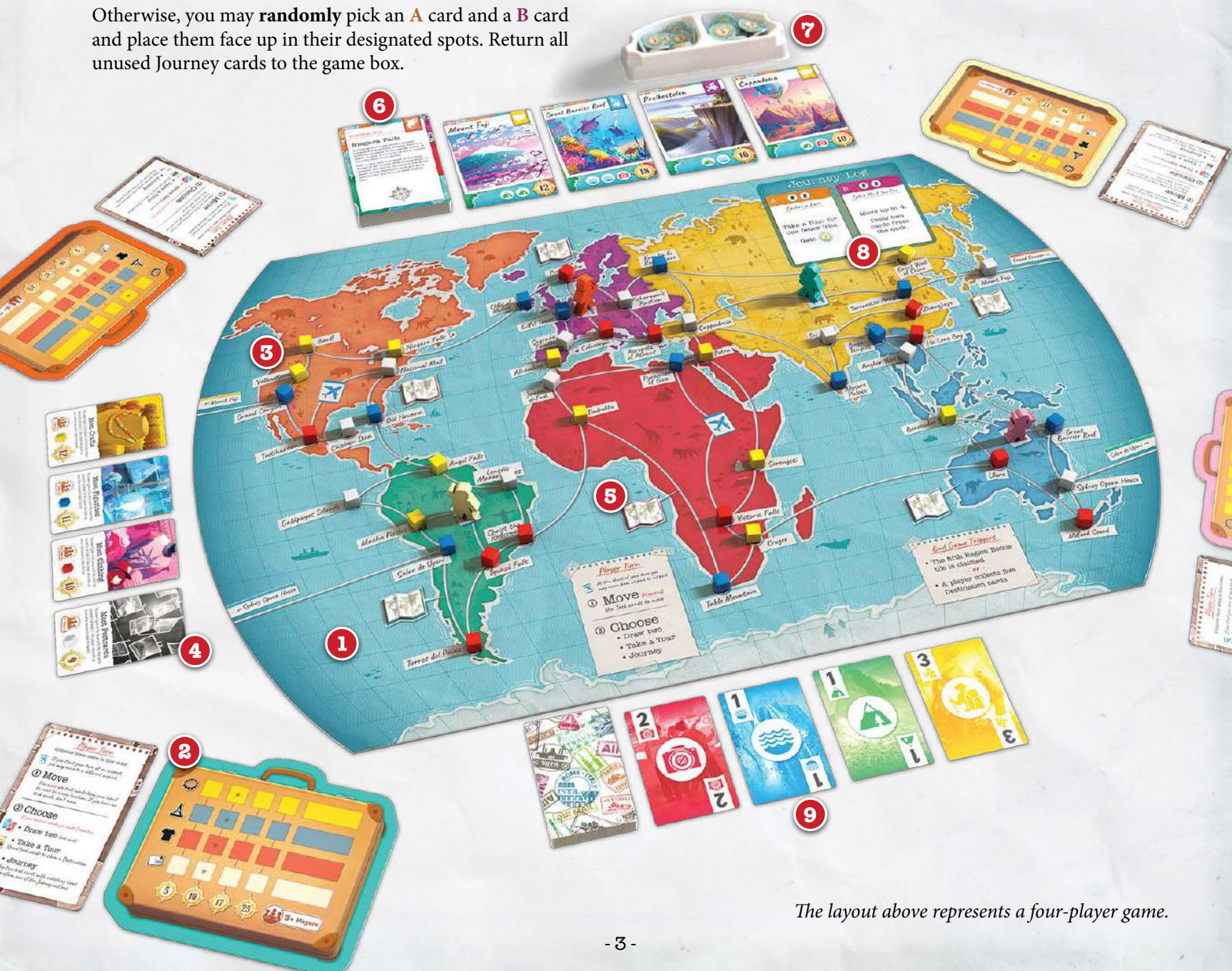
The layout above represents a four-player game.

You are now ready to play Trekking the World!