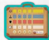
5 Suitcase mats