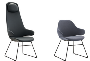
HIGH BACK Black PU

Sled Base High Back KON182 Sled Base Mid Back KON186