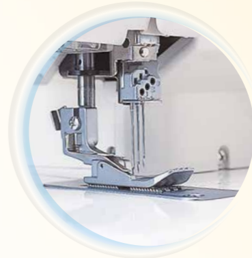
Drop feed system