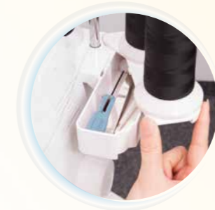
Built-in accessory compartment