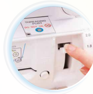
Jet-Air Threading™ System