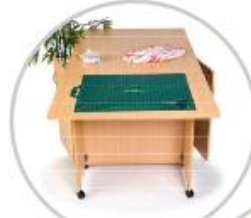
Useful storage cupboards both sides...