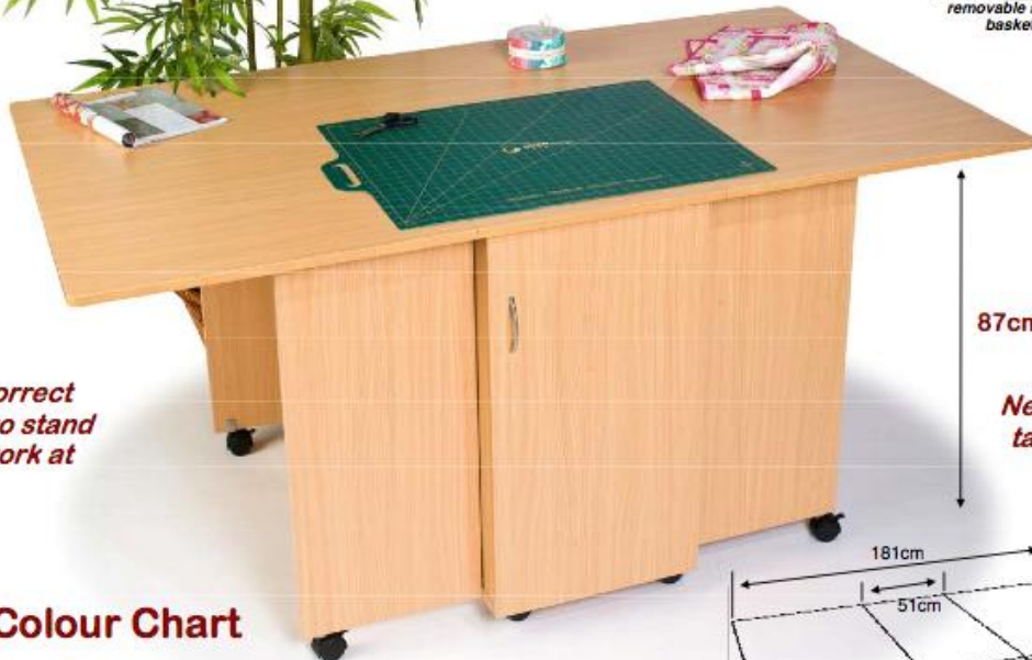
The correct height to stand and work at