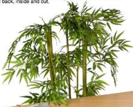
Extra stable double leg design