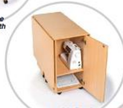
...one side fitted with an adjustable shelf for larger items...