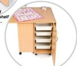
...the other fitted with removable storage baskets.