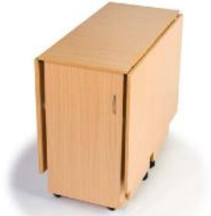
Slim & Mobile when closed