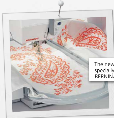
The new Maxi Hoop was specially developed for the BERNINA 7 Series.

Both the B 790 and B 770 QE can embroider, though the B 790 offers even more features and options for embroidery lovers. Switch to embroidery mode directly via the touch screen. Embroidery mode lets you easily position, mirror, rotate and resize motifs. Design editing on the B 790 offers a wealth of additional options, allowing you to create curved lettering effects, alter stitch density, and combine decorative stitches or alphabets with embroidery designs. Complex combinations can even be resequenced according to colour, and alternative colour options can be reviewed before stitching out. With both models, the finished design can be saved directly on the machine or on a USB stick. What's more, further designs can be imported to the machine via the USB port. The Check function lets you position the design precisely before embroidering. The embroidery module comes as standard with the B 790, and is available as an optional accessory for the B 770 QE.