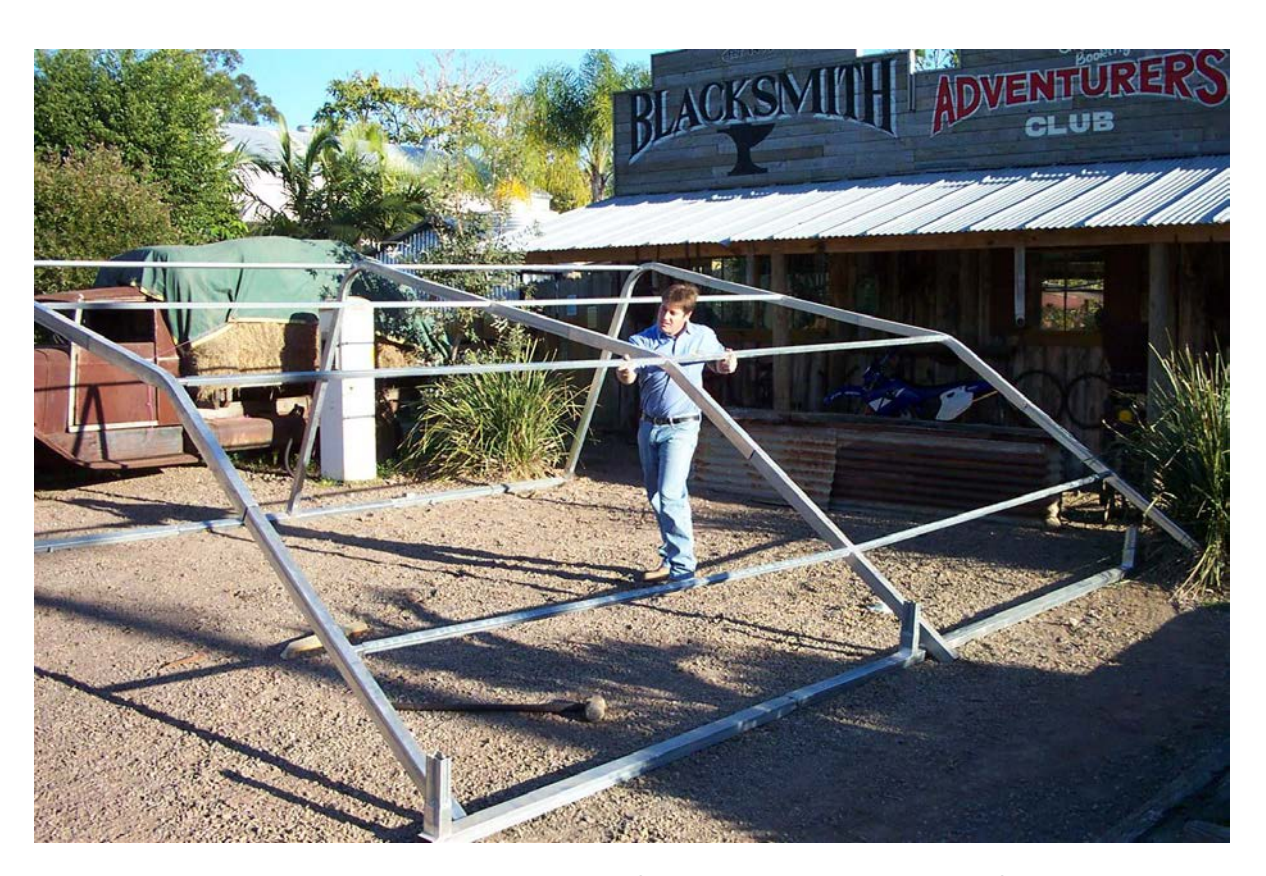
INSERT THE SUB FRAME (NO LADDER REQUIRED)