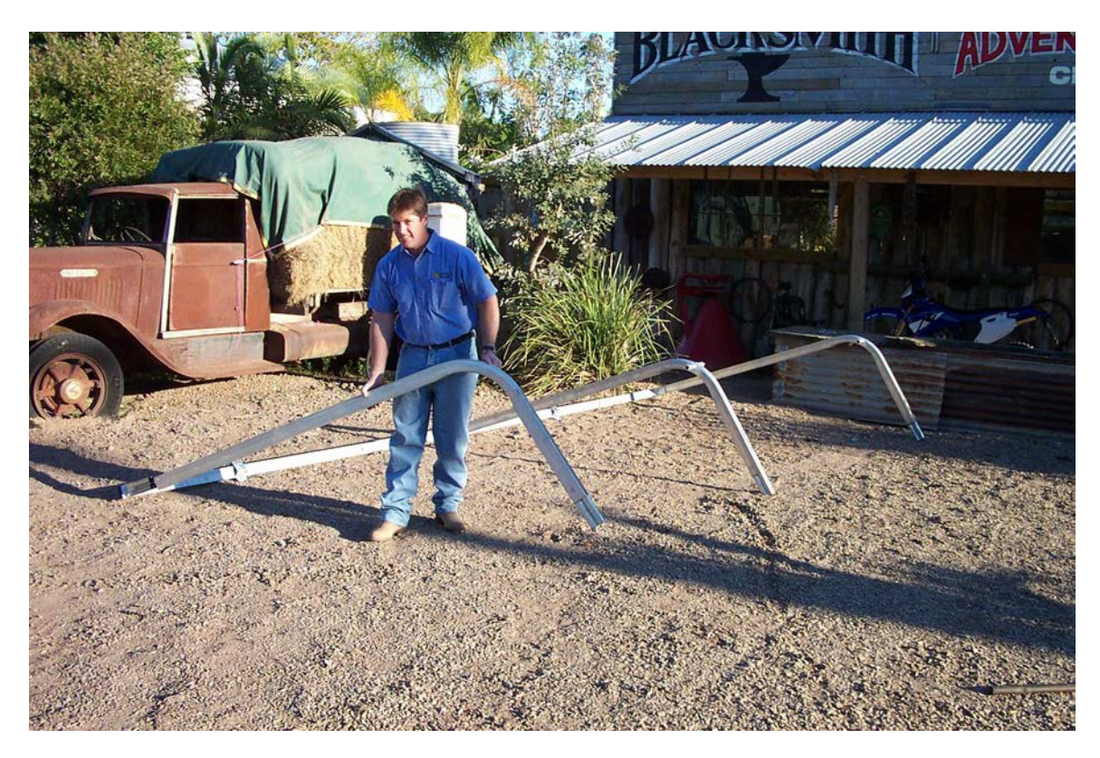
ATTACH THE PORTAL FRAMES