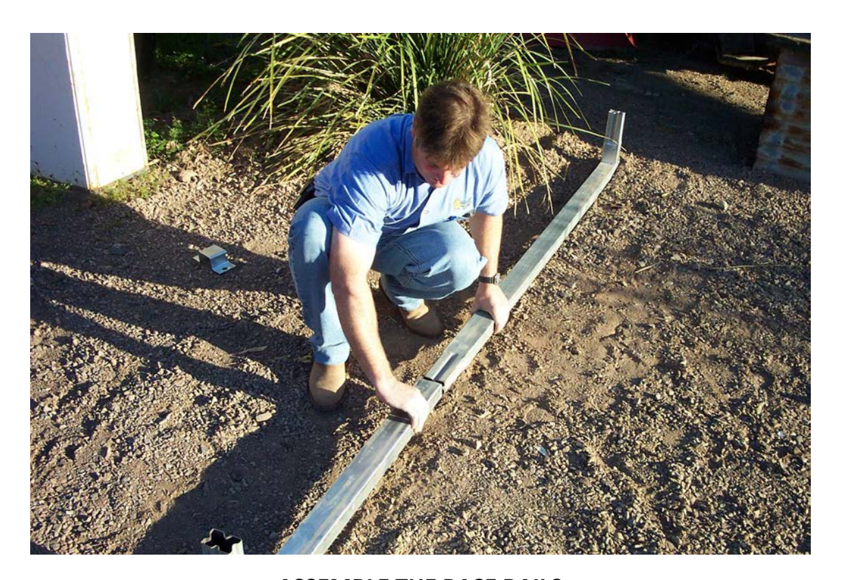
ASSEMBLE THE BASE RAILS