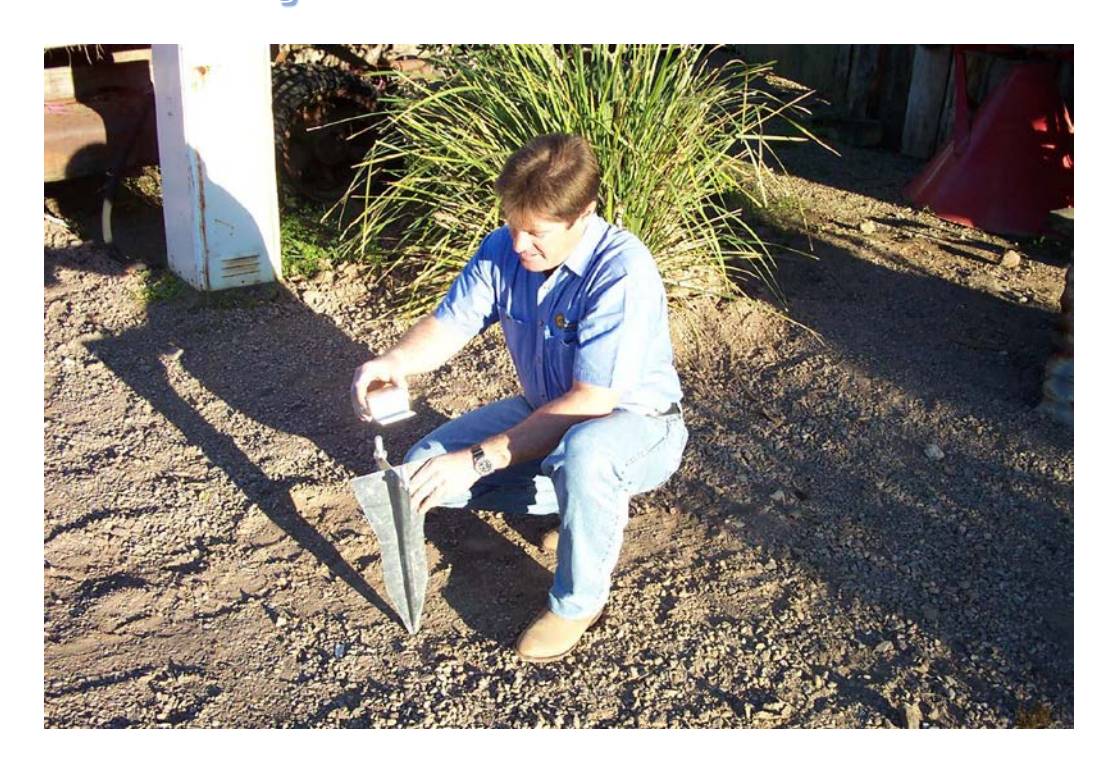
POSITION THE HOLD DOWN PEGS