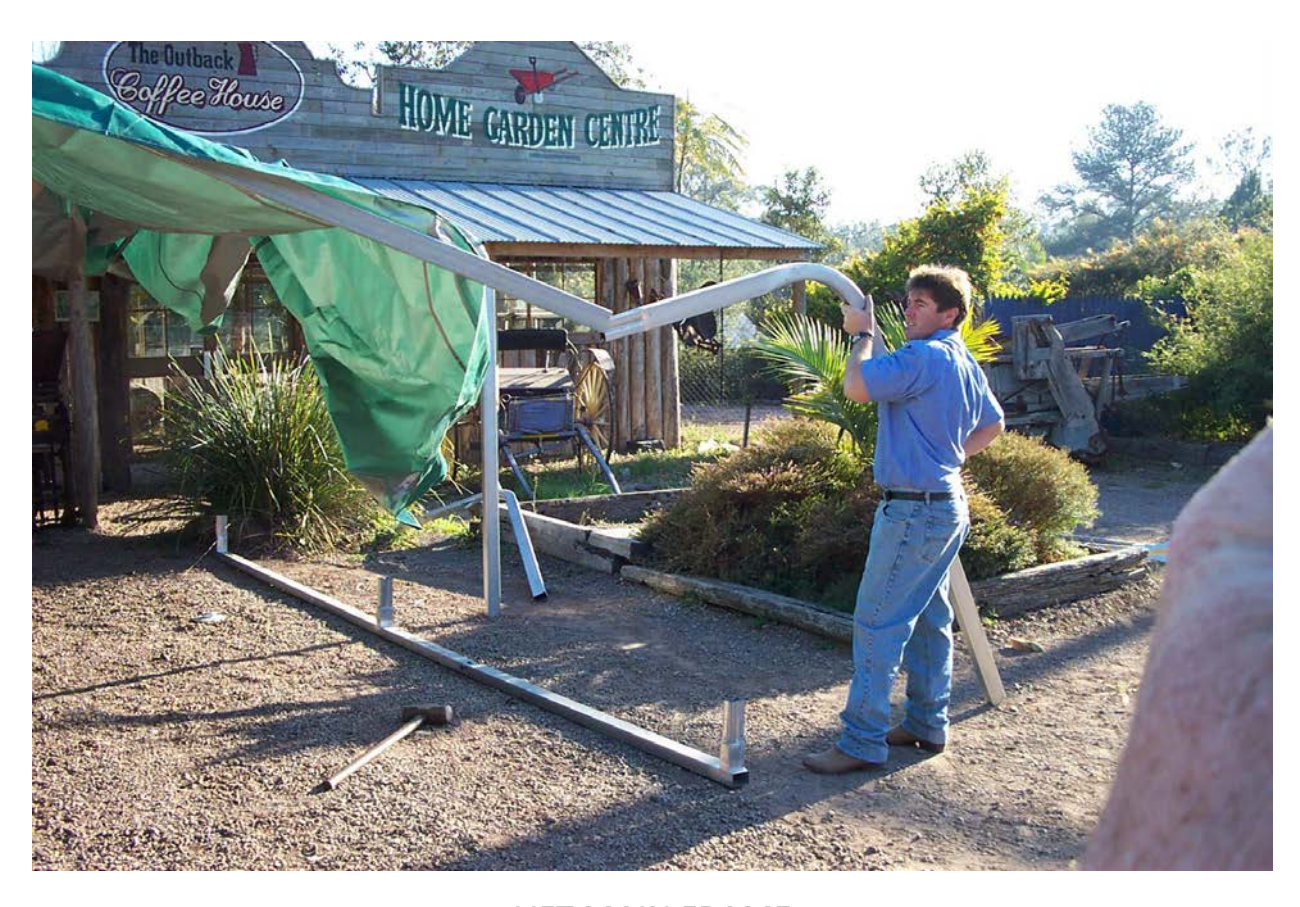
LIFT MAIN FRAME