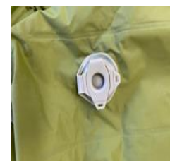
C. Shut off plug

It will take approximately 4 minutes to fully inflate the cover depending on the size of the cover. Inflate the cover to the maximum but do not overinflate. Ensure the 4 inlet valve plugs are fully sealed for the cover to remain inflated. In the event, that there is a minimal air pressure loss, top it up with the provided pump by using the one-way inflation plug "B". Air loss is a natural reaction for this type of material; especially when the covers are new, TPU material becomes soft and stretches. Inflate the cover every few days if there is air loss. ONLY INFLATE THE COVER WITH THE PROVIDED PUMP. The pump has 3 different nozzle sizes, use the nozzle suitable to suit the cover.