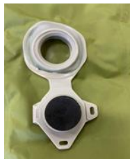
A. Fully open plug

Note: for quick inflation of the cover use the fully open inflate "plug A ". Some air will escape from the cover when fully inflated in this mode. To further inflate the cover to its maximum use the one-way inflation mode plug B . To fully seal the cover once fully inflated use shut off plug C .