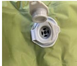
B. One-way plug