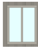
790 x 589