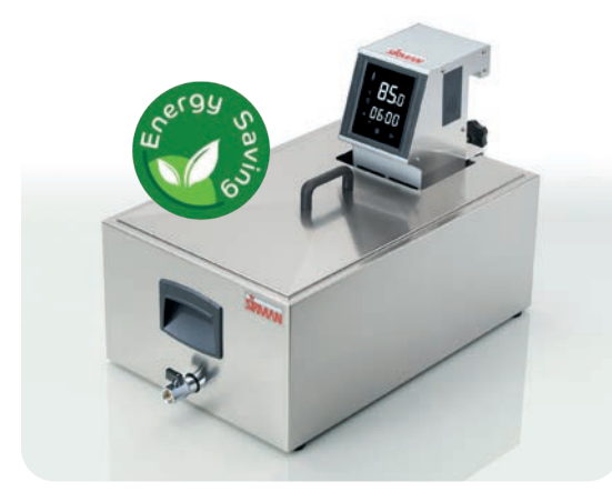
Optionals s/steel container with lid 1/1 and 2/1 GN