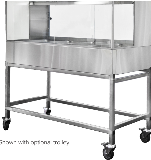
Shown with optional trolley.