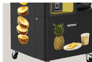
Isla is customisable

You decide what your Isla will look like. Our new model will quickly and easily adapt to your establishment. Customise the graphics and stickers to fully match the aesthetics of your business.