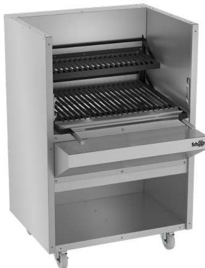
EXAMPLE PHOTO: 800mm / 31 1/2 MANUAL LIFT GRILL