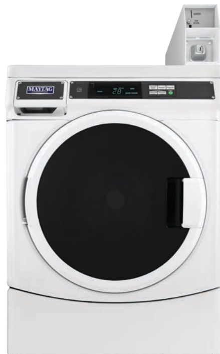
COIN DROP OR CARD READER READY MHN33PD (pictured)