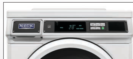
NON-COIN MHN33PN (pictured)