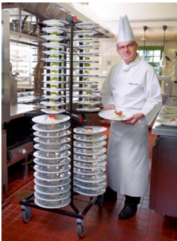
Designed by Chefs and used by Chefs

Totally versatile, the JS104 can accommodate several different size plates at the same time, and can be loaded and unloaded from four sides, and carry 400 empty plates to the dishwasher.