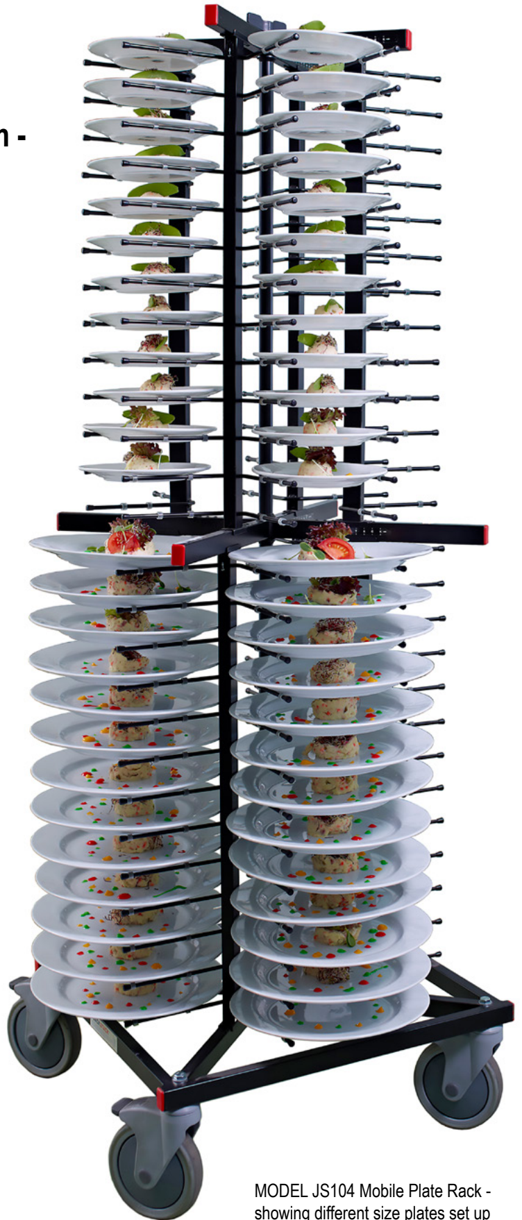
MODEL JS104 Mobile Plate Rack - showing different size plates set up on the upper level.