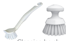
Cleaning brush Small/Large