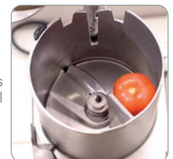
Stacking of tomatoes on cylinder wall