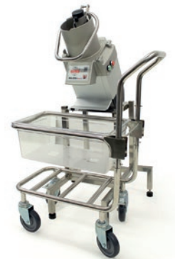
Machine Table, Container Trolley & RG-250 diwash