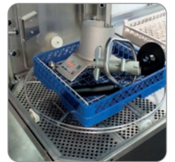
Machine washable parts

The machine is also designed with even surfaces, rounded edges and without recesses to avoid food residue accumulation.