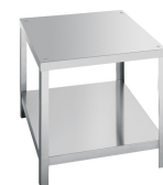
WS5 Underframe for glasswashers 500mm