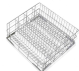
WB50G04 Wire basket for glasses with inclined bottom 500x500