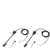
KITSONLIV Probe level kit