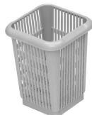
PHOOS01 Single basket in polypropylene for cutlery