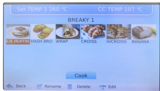
Fully programmable touchscreen controls