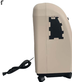
Transom filter is the black vent on the side

1. Transom filter - Clean as needed. Check the filter every 2 weeks and clean if visibly dirty. Use a small screwdriver to unscrew the block of transom filter holder, then take the transom filter holder out from the access door. Separate the holder pieces and take the filter out.