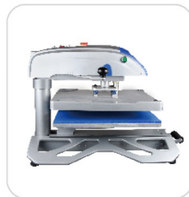
4.5 cm Thickness