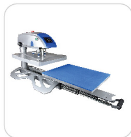
Pull Out Drawer