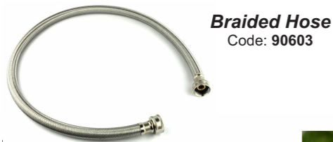
Braided Hose Code: 90603