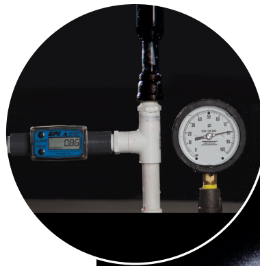
OPTIONAL PRS IN-STEM PRESSURE REGULATION