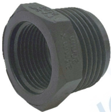
1" x 3/4" Bush