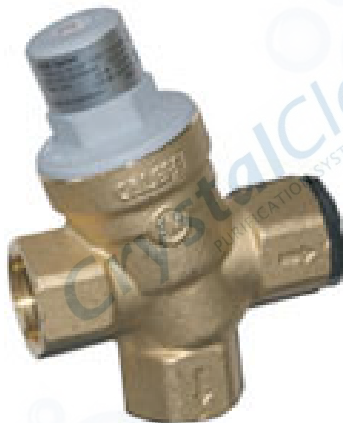
3/4" Caleffi PRV