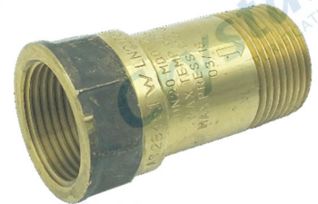
3/4" M x 3/4" F Dual Dual Check Valve