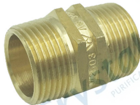
3/4" x 3/4" Nipple