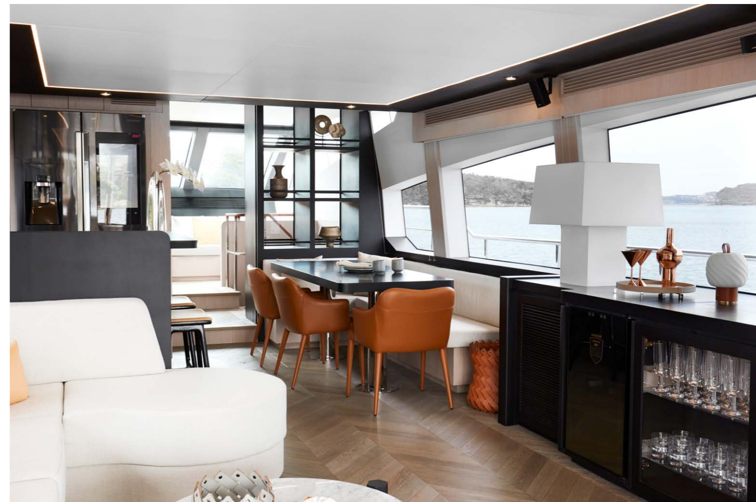
This page, from top On deck, a Georg Jensen champagne bucket sits invitingly on a 'Samurai' leather tray from Pinetti. The custom marine decking was designed to match the interior flooring. Inside, the custom sofa by Infinite Design Studio was upholstered in Hermès 'Terre d'H' outdoor fabrics from South Pacific Fabrics. The tan 'Embellish' leather dining chairs are from Zuster and the custom stools designed by Infinite Design Studio. Moooi table lamp by Marcel Wanders and Tom Dixon cocktail shaker and glasses from Living Edge. Opposite page The bench seat and cushions are upholstered in Hermès 'Terre d'H' outdoor fabrics from South Pacific Fabrics. Custom solid-timber table by Infinite Design Studio and director's chair from Analu.