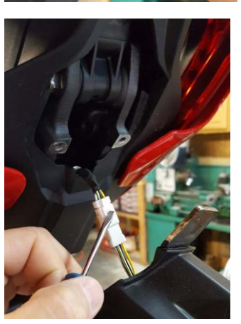
3. Use a little flat head screwdriver to disconnect the plate arm wire connector