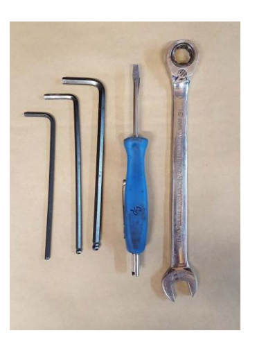
Tools Needed 2.5mm Hex Wrench 3 mm Hex Wrench 4 mm Hex Wrench 10mm Wrench Small Flat Head Screw driver Medium strength thread locker (Blue Loctite)