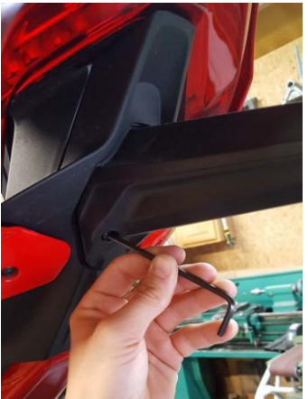
1. Remove the 2 fasteners retaining the plate arm