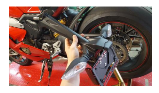
4. Throw in garbage