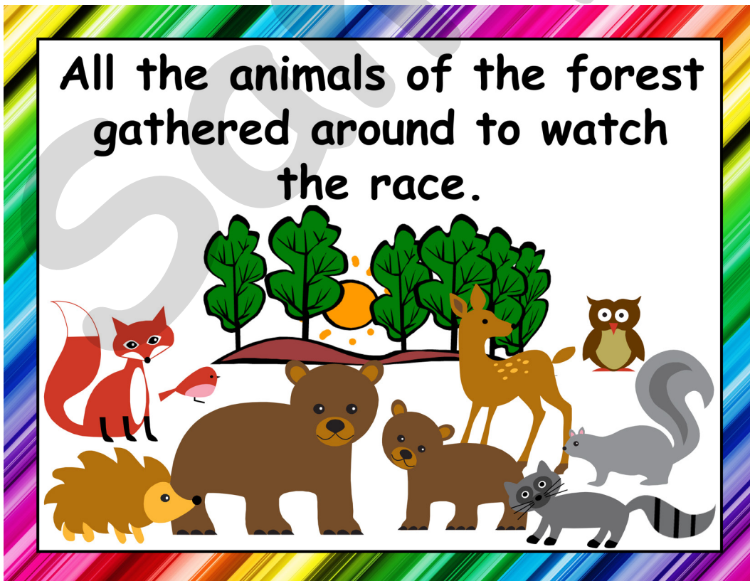
6. Movie Rabbit and Turtle (long and short)