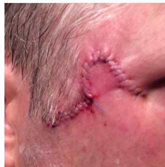
Day after Mohs surgery to remove basal cell carcinoma