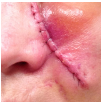
Day after Mohs surgery to remove basal cell carcinoma