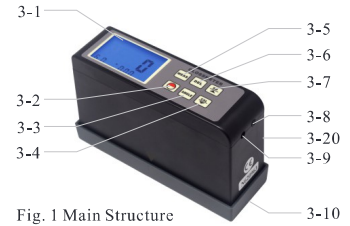
Fig. 1 Main Structure