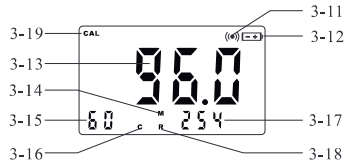
Fig. 2 Display

This Gloss Meter is small in size, light in weight, easy to carry. Although complex and advanced, it is convenient to use and operate. Its ruggedness will allow many years of use if proper operating techniques are followed. Please read the following instructions carefully and always keep this manual within easy reach.