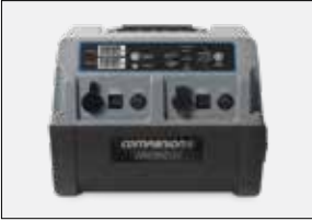
1 x 44Ah Power Pack