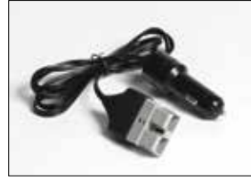
1 x 12V DC charging lead (10A fused) 1.3m