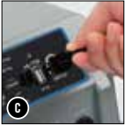
5V DC USB port