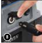
12V DC Merit style plug socket