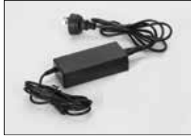
1 x 6A 240V AC charging adaptor