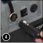
12V DC cigarette lighter socket