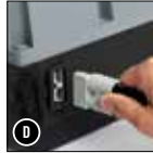
12V DC Anderson style plug socket