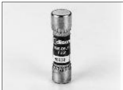
Catalog No. MEQ (0.1 - 30A) 500Vac or Less Time-Delay