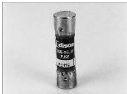
Catalog No. MEN (0.1 - 30A) 250Vac or Less Time-Delay