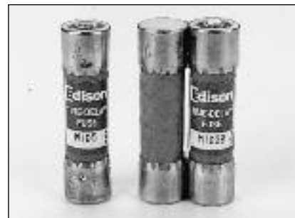
Catalog No. MID (0.1 - 30A) 0.1 - 6A 250Vac or Less 6 1/4 - 15A 125Vac or Less 20 - 30A 32Vac or Less Pin Indicating - Time-Delay