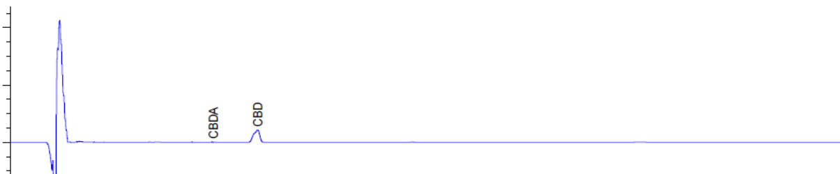
Figure 2. Chromatogram of the analysis

The sample passes all acceptance criteria for CBD, CBN and THC.