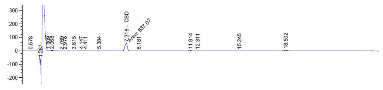
Figure 2. Chromatogram of the analysis

THCA- delta-9-Tetrahydrocannabinolic Acid. The legal limit for both THC and THCA of this compound is 1mg per container