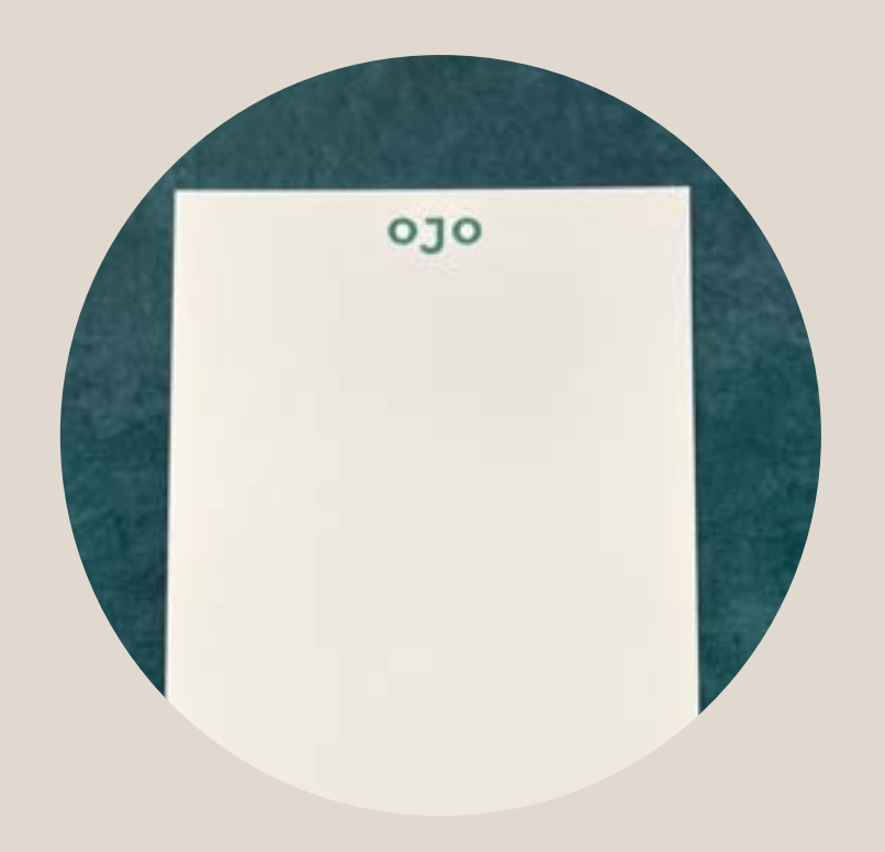
Stationery + Insert