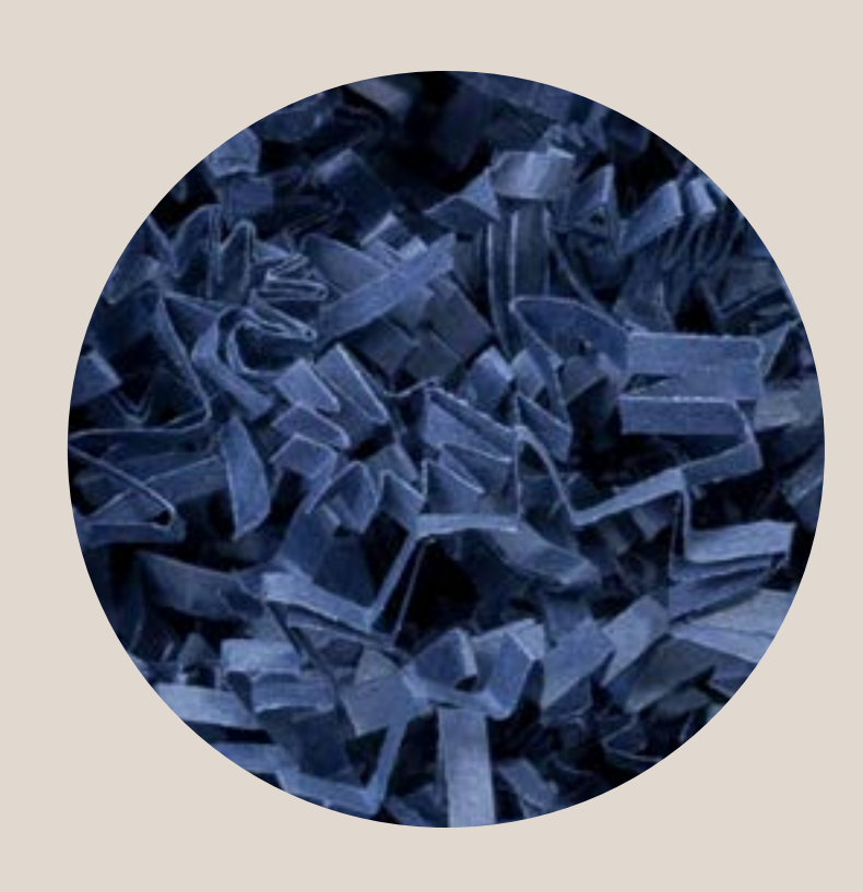
Custom Shred Color