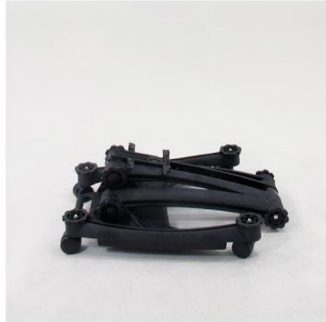
2. SET UP, LOOSEN KNOBS Not too loose, start at base knobs.