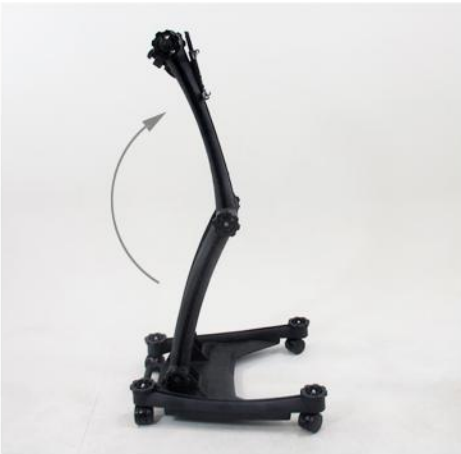
4. RAISE TOP ZBONES UPWARD and then re-tighten knobs.