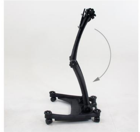
3. LOOSEN MID-KNOBS AND MOVE TOP ZBONES to down position then tighten. REMEMBER: RIGHTY TIGHTY, LEFTY LUCY