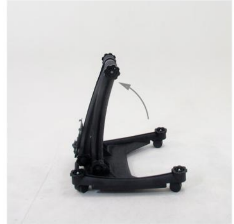
3. RAISE BASE LEGS Raise to almost 90° and then thghten knobs and lockdown to base.