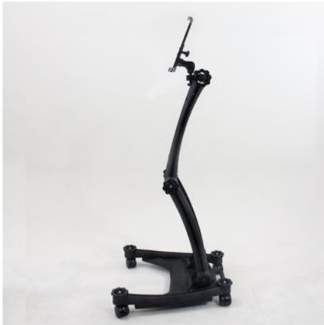
1. REMOVE ALL ELECTONICS AND EQUIPMENT before disassembly

When turning knobs remember: Righty tighty (not too tight), and Lefty Lucy (Just loose enough to re-position)