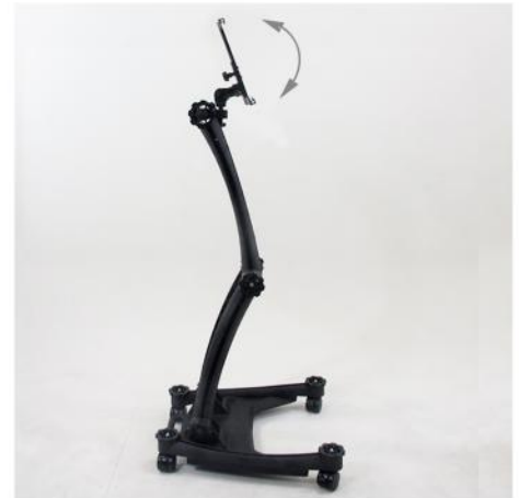
6. ONLY AFTER COMPLETELY TIGHTENED, For patented "Unibody Locking System" can you then add tablet

Combines a stylish appeal with affordability, portability, and versatility. The ZStand seamlessly fits into any office or home-entertainment room without compromising aesthetics. All ZStand models are ergonomically designed, are made from 100% recycled materials and are effortless to setup or take down.