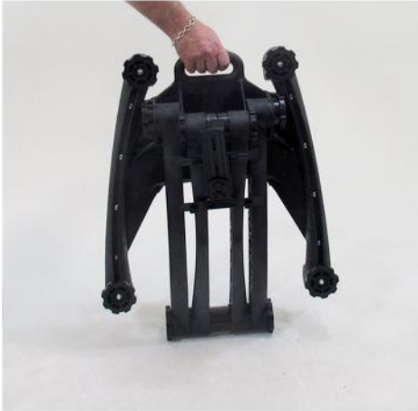
1. CARRY MODE. All knobs tightened in transit

When turning knobs remember: Righty tighty (not too tight), and Lefty Lucy (Just loose enough to re-position)