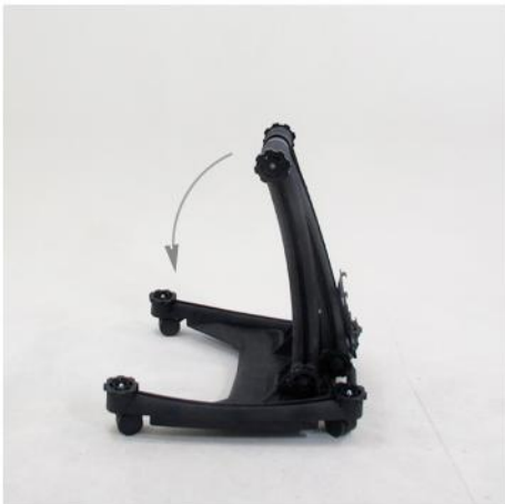
4. FLIP DOWN BASE-ZBONES and then re-tighten knobs.