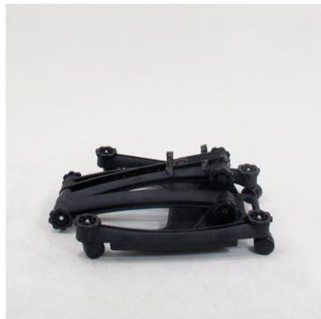
5. MAKE SURE ALL KNOBS ARE TIGHTENED