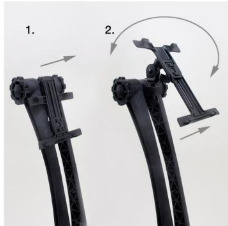
5. PULL OUT HEAD ASSEMBLY AJUST AND LOCKDOWN