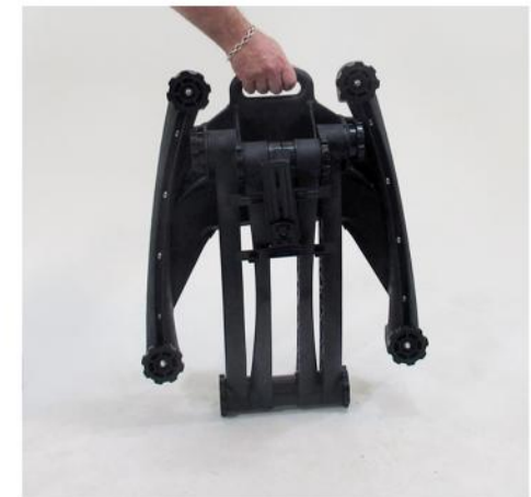
6. ALL KNOBS ARE TIGHTENED and now you're ready to go!

Warrenty: ZStands are durable and stronge. In the unlikely event that a ZStand should fail within a year after the original purchase due to a manufacturing defect, ZStand is pleased to repair or replace that product.