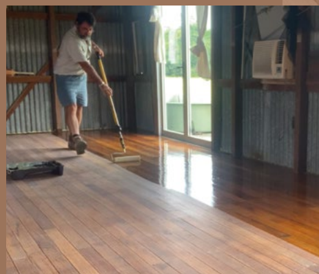
Applying hardwax oil with a roller.