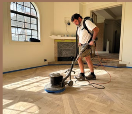
Sanding the floor with an industrial sanding machine.