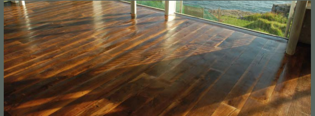
A bespoke floor, crafted from 100-year-old French oak beams, we installed in Bronte, Australia.