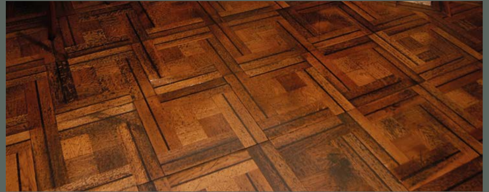
An 80-year-old reclaimed parquet floor we installed in the UK.

It's impossible to overemphasize the importance of using quality products when working with timber flooring - products that not only make a floor look beautiful but also give it protection from everyday wear and tear. Thankfully, our journey led us to the very best hardwax oils made in Germany. That was over 20 years ago and we haven't looked back since. In this brochure, we've done our best to distill as much of our knowledge and experience as possible. We hope you find it useful.