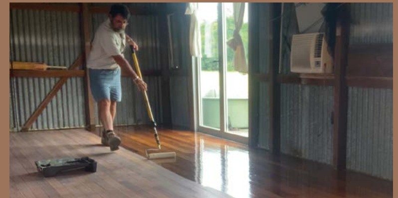
Applying hardwax oil with a roller.