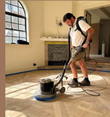
Sanding the floor with an industrial sanding machine.