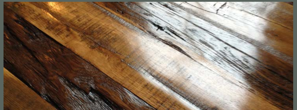
A 1930 heritage floor we sanded and waxed in Sydney (using a technique that maintained the floor's character while ensuring it was perfectly smooth to walk on).