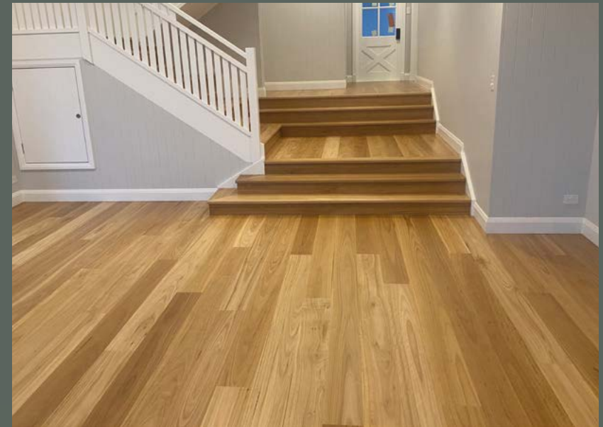
This beautiful European Oak floor is coated with our Evolution Hardwax Oil (Matte).