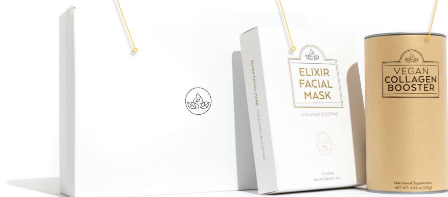
Vegan Collagen Booster