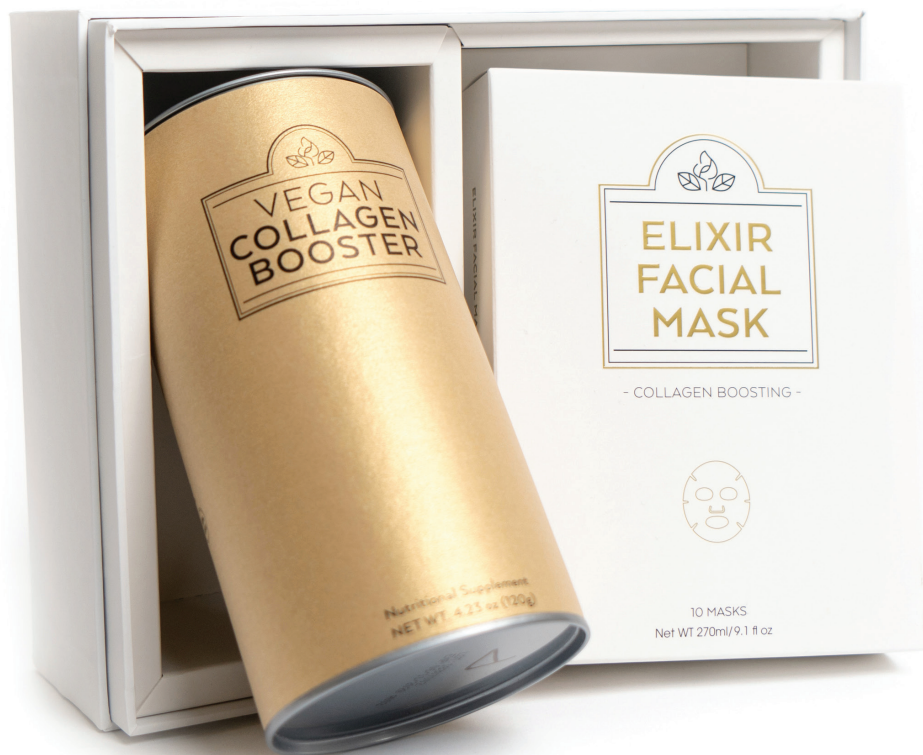
Glowing Beauty Duo Set Box