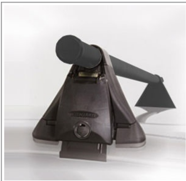
Yakima: Aftermarket round crossbar roof racks.