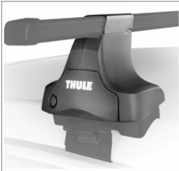
Thule: Aftermarket rectangular crossbar roof racks.

You will need to acquire roof racks for your vehicle before you purchase a car rack for your scull. Revolution Rowing only sells accessory racks that mount to existing vehicle roof racks. There are (4) general types of racks available on the market.