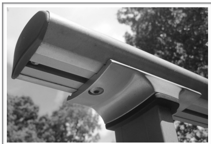
Oversized Roof Racks: Usually seen on truck racks and sometimes as oversize factory racks, these crossbars are greater than 1.5" in height (thickness) and greater than 2.5" in width. These racks will require additional u-bolts to attach Revolution Rowing accessory skull racks.