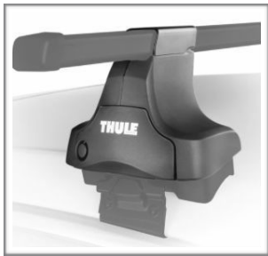
Thule: Aftermarket rectangular crossbar roof racks.

If you do not currently own vehicle roof racks, you will need to acquire them before you purchase a rack for your skull. The racks that Revolution Rowing sells are accessory racks that are meant to mount to existing vehicle racks. There are (4) general types of racks on the market.