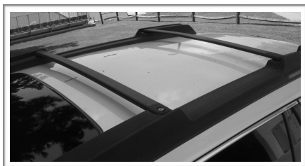
Factory Roof Racks: Blade shaped crossbars that come pre-installed on a vehicle. These racks are not made to hold as much weight as Thule or Yakima roof racks and may require additional straps or tie down points when transporting boats.