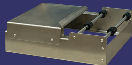
Product Table & Film Feed Unit

WORLD-LEADING PACKAGING MACHINERY DESIGNED & BUILT IN THE UK