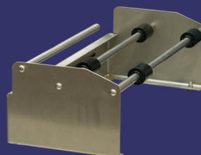
Compact Film Feed Unit

Simply connect the desired unit to your machine and you are ready to seal.