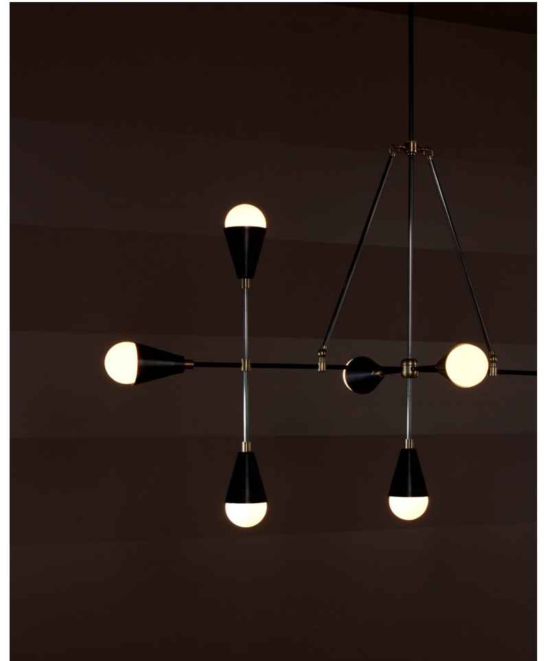
AGED BRASS / BLACKENED BRASS