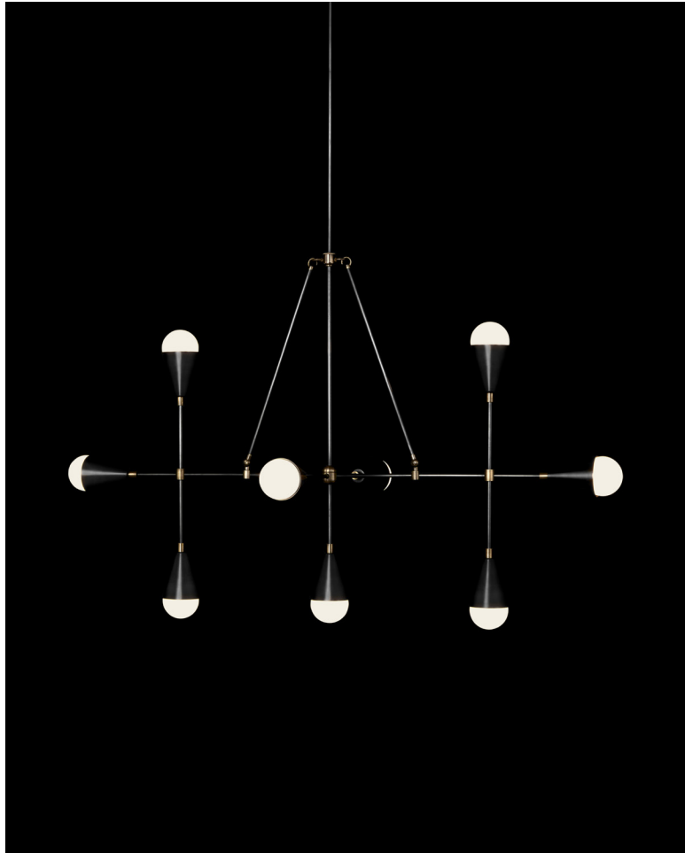
AGED BRASS / BLACKENED BRASS