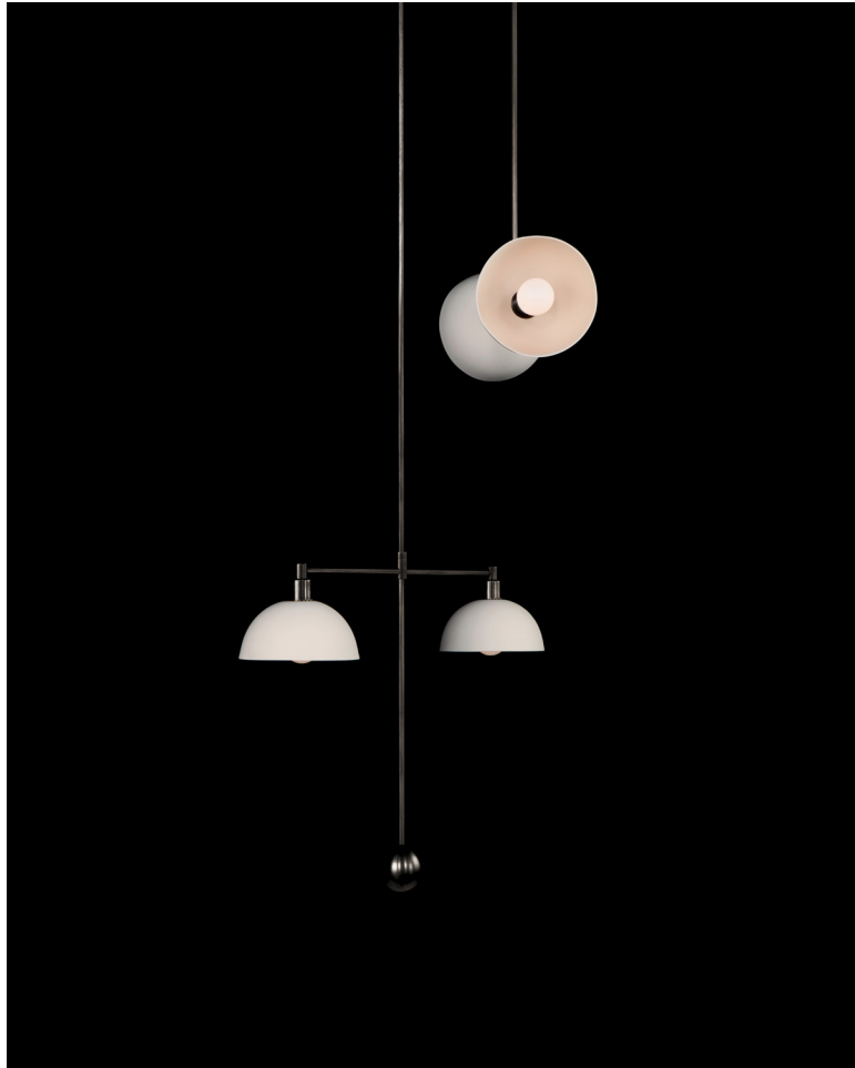
BLACKENED BRASS / PORCELAIN