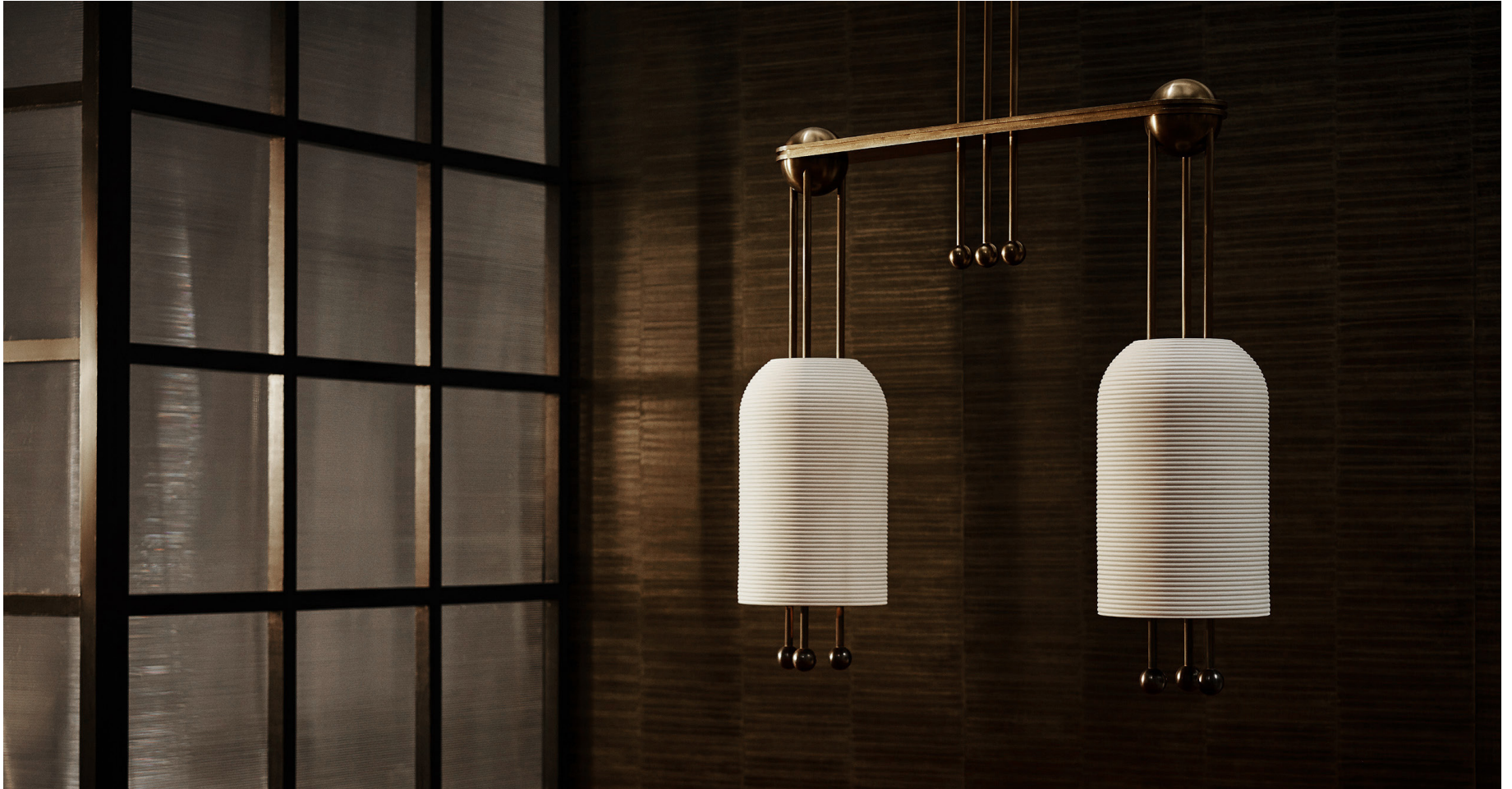
AGED BRASS / BLACKENED BRASS