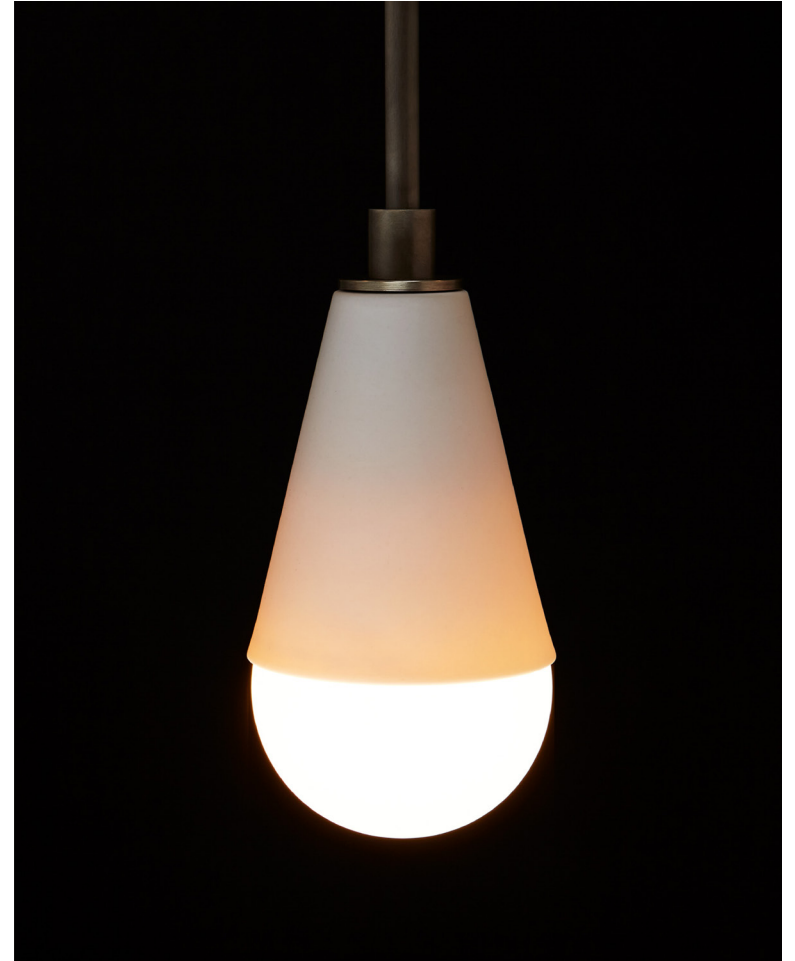
AGED BRASS / PORCELAIN