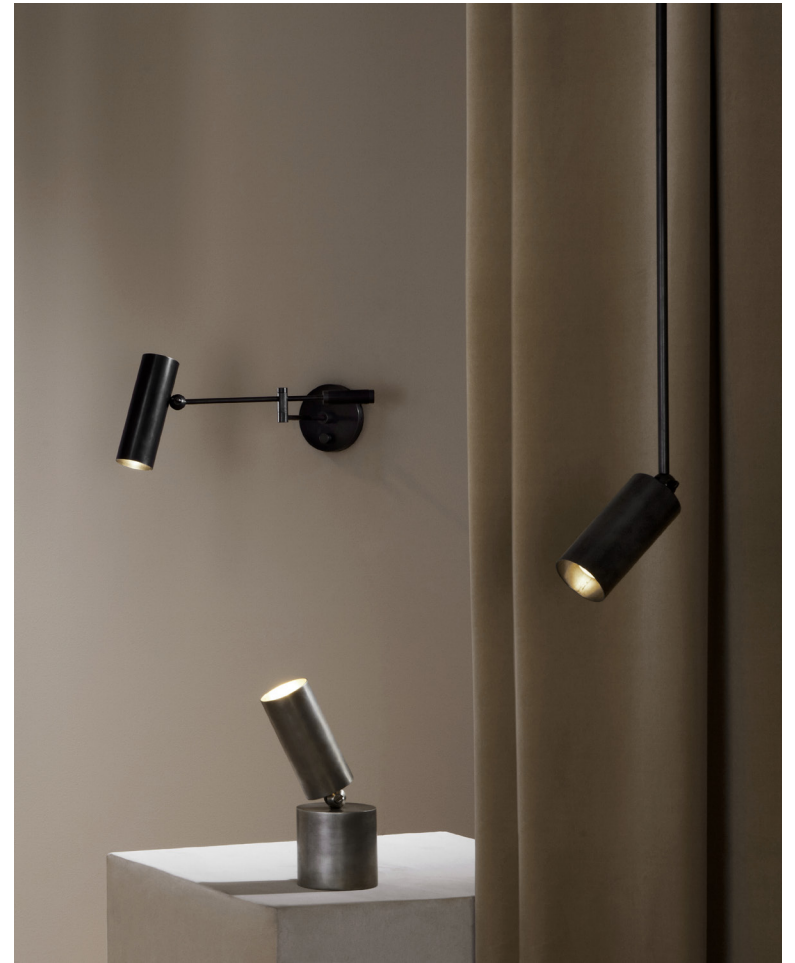
BLACKENED BRASS | TARNISHED SILVER | BLACKENED BRASS